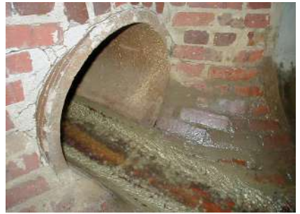
Bacteria growth in outfall