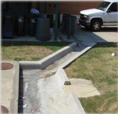
Photo to right shows glue rinse in drainage channel near the school. Photo below shows area of the school where district staff were rinsing trash cans into the storm drain.

The City of Denton was notified by a resident when a white milky liquid was seen flowing down a concrete channel. They discovered that the liquid in question was glue and that local school district maintenance staff were washing out trash cans into the storm drain.