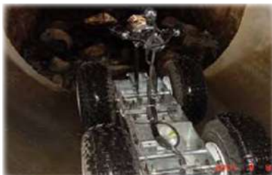
Dye testing example on the left, video on the right.