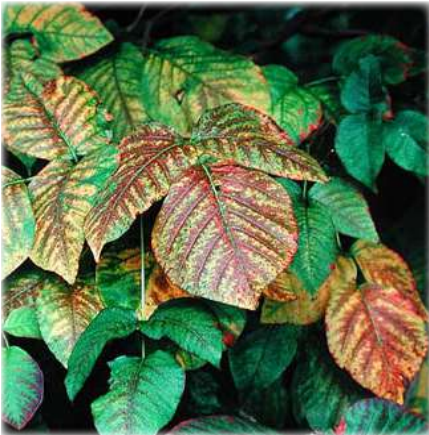
Poison Ivy - Fall