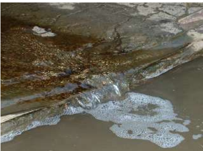
Low severity, naturally occurring suds