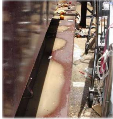
Photo right shows leaking from the dumpster and debris accumulation. Photo below shows leaking fluids going toward a nearby storm drain.

During routine stream sampling, the City of Grand Prairie detected very high ammonia-nitrogen levels. City staff were able to trace the contamination to a nearby grocery store where wastewater from an organics dumpster was leaking into the storm drain.