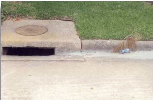
Potential outfall issue with presence of at least one physical indicator – paint stains