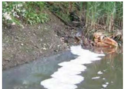
High severity suds

Sewage fungus photo courtesy of Wayne County Illicit Discharge Elimination Program, natural sheen image courtesy of NOAA's National Ocean Service, synthetic sheen photo courtesy of Jane Thomas, IAN Image Library ( ian.umces.edu/imagelibrary/ ), all others courtesy of the Center for Watershed Protection.