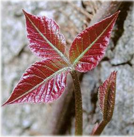
Poison Ivy - Spring