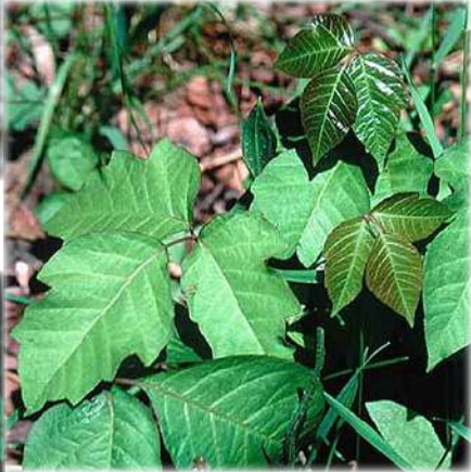
Poison Ivy - Summer